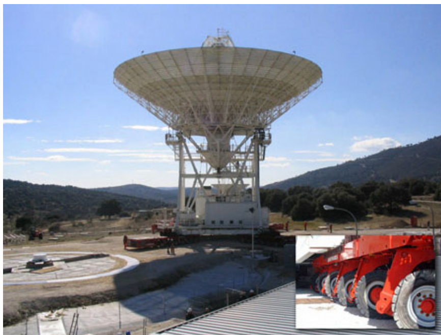
Giant Deep Space Network antenna in Madrid is moved using four 12-axle, 24-wheel crawlers.

This article was provided by the Jet Propulsion Laboratory, California Institute of Technology, under a contract with the National Aeronautics and Space Administration.