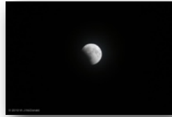
by John McDonald

The Moon will become a little darker than normal in the early morning hours of June 4th. Starting around 2 am the Moon will start to slide into the Earth's shadow and become progressively darker until the Southern most part seems to be missing. Greatest eclipse is at 3:03 am so if you're a night owl have a look outside and see an interesting sight. The Moon sets before it comes out of eclipse.