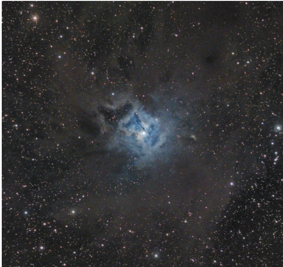
Iris Nebula